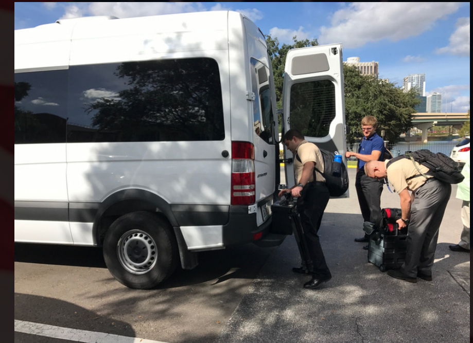
VETERANS STORY DAY