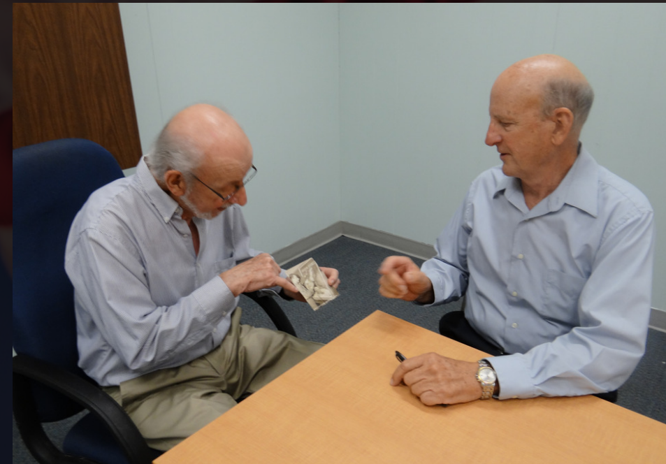
PEER TO PEER PROGRAM