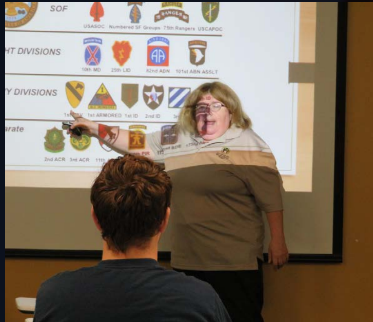
ORAL HISTORY & MILITARY 101 TRAINING